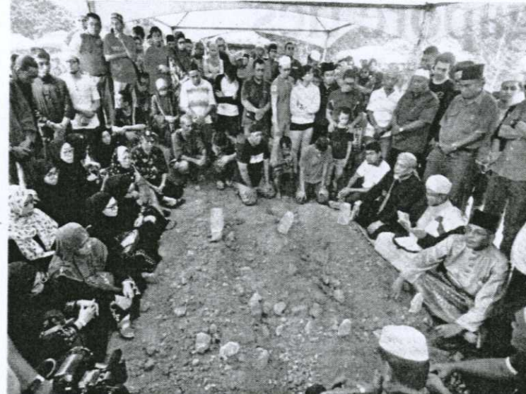
People attending the funeral of a family of three who were slashed to death, at the Bertam Malim Muslim Cemetery in Malacca, yesterday.