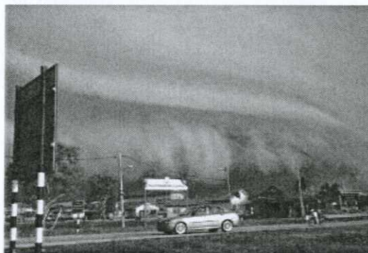
Formasi awan luar biasa berbentuk 'ombak besar' dan 'puting' beliung yang berlaku di Langkap, Teluk Intan

Published on Friday, 26 August 2016 15:45